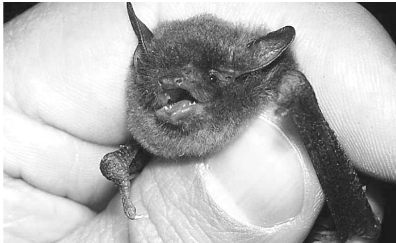
In 2009, a Michigan resident unfortunately died from rabies that he contracted from a bat exposure.

Do not let pets roam free. Spay or neuter pets to reduce